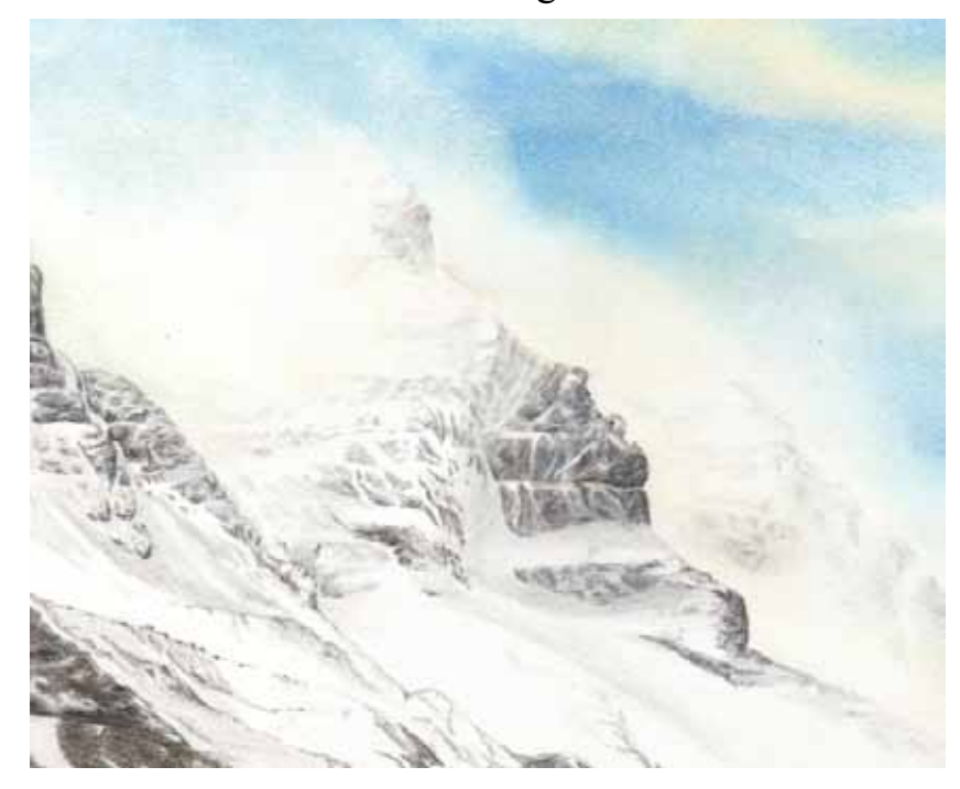
(Detail) Steadfast, Watercolor, 29in x 21in, 72.5cm x 52.5cm

Jeremiah 16:19 O LORD, my strength and my fortress, my refuge(1) in time of distress, to you the nations will come from the ends of the earth and say, "Our fathers possessed nothing but false gods, worthless idols that did them no good.